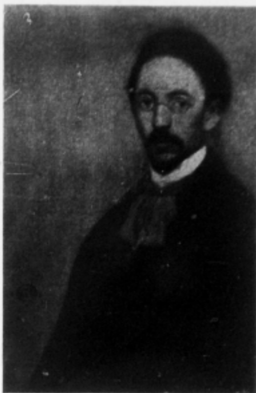
H. O. TANNER, BY H. D. MURPHY