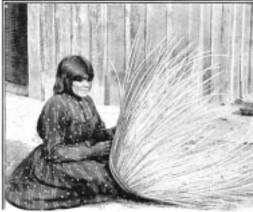
METHOD OF WEAVING.

last round; a stitch at a time the grass-root fiber passes over them solidly, beneath one willow of the previous round, the thread being constantly dampened in a cup of water—or, still more conveniently, in the mouth—before passing through a little opening made by an awl.