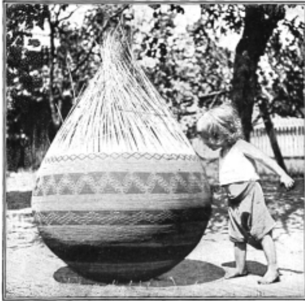
STORAGE-BASKET, UNFINISHED, FOUR FEET IN DIAMETER.

varieties are usually made by men who are too old to go out as day-laborers, and are the only kinds devoid of some sort of decoration, except a short-handled, frying-pan-shaped affair, which is used in beating off the seeds of plants into closer-woven baskets. This last-named is the only basket to which a handle is attached, and lids, such as some tribes make, are not known.