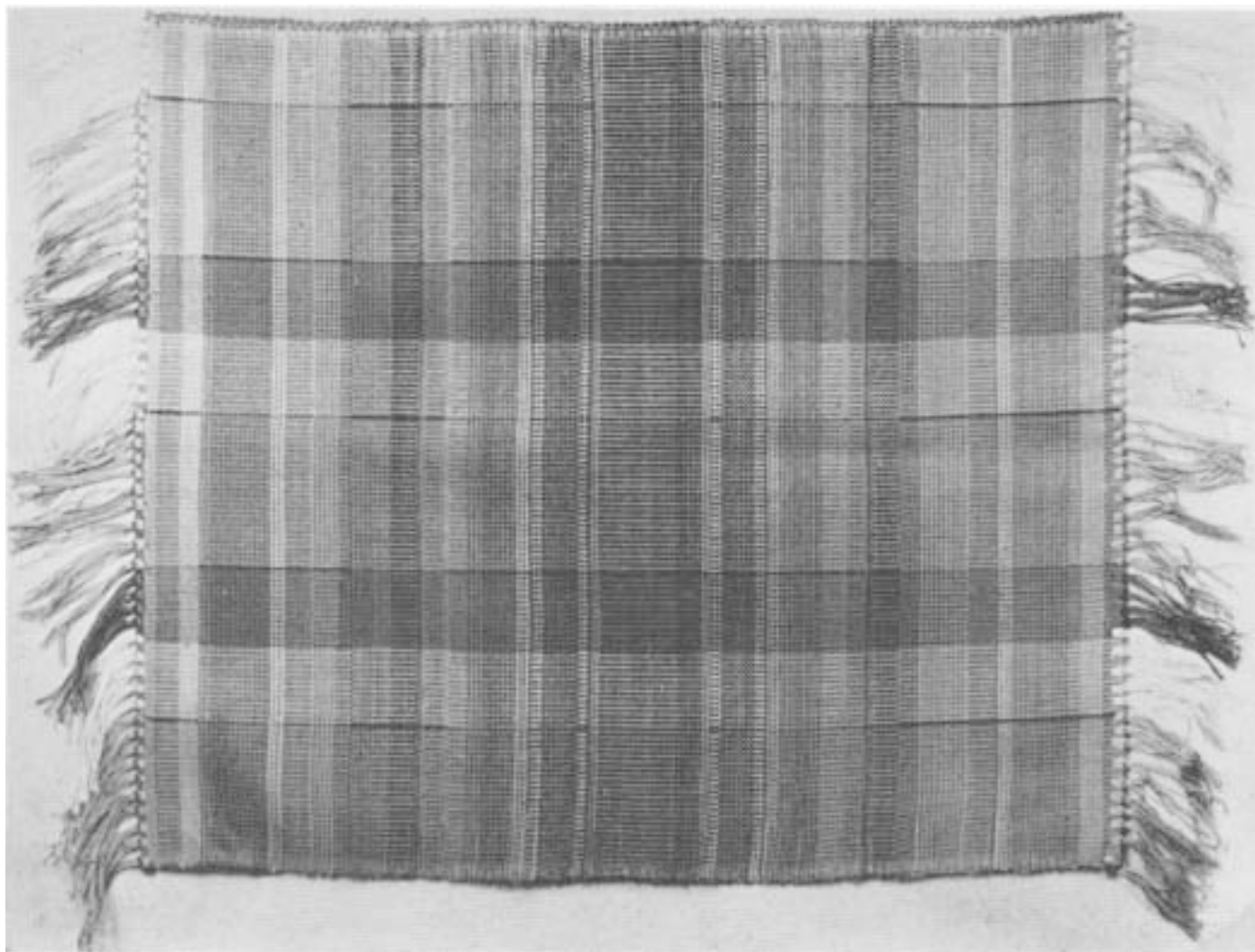
One of a pair of pillow tops

Strictly speaking, there are five warm colors, yellow, orange, red, yellow green and red violet, with their variations. On the other hand, there are three cool colors, blue, blue green, and blue violet. Grass green, and violet which is an equal mixture of blue and red, more nearly approach neutral. Then there are the neutrals proper, namely, white, black, gray (either warm or cool), silver and gold.