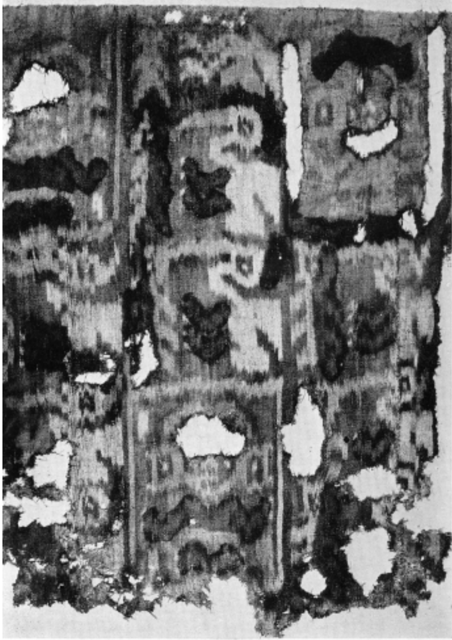
PLATE II DETAILS OF THE PATTERN ROW.