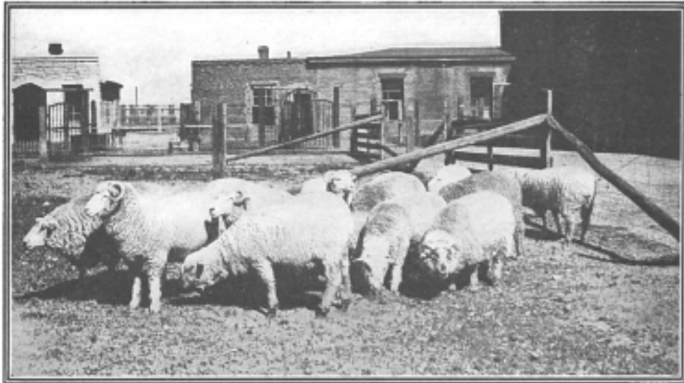
FINE FAT SHEEP AT THE LARAMIE EXPERIMENTAL STATION.