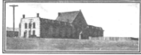
ABANDONED PENITENTIARY AT LARAMIE, WYO., WHERE GOVERNMENT SHEEP BREEDING IS BEING CARRIED ON.

Here steps in Uncle Sam with a remedy. It is known that Nature is ready to adapt animal life to all circumstances, if given half a chance. So the government has established an experiment station at Laramie, Wyoming, in the center of the great Western sheep belt, and is endeavoring to produce a typical range sheep that will thrive among the comparatively harsh conditions of the high plains country and that will yield a maximum amount of wool and mutton.