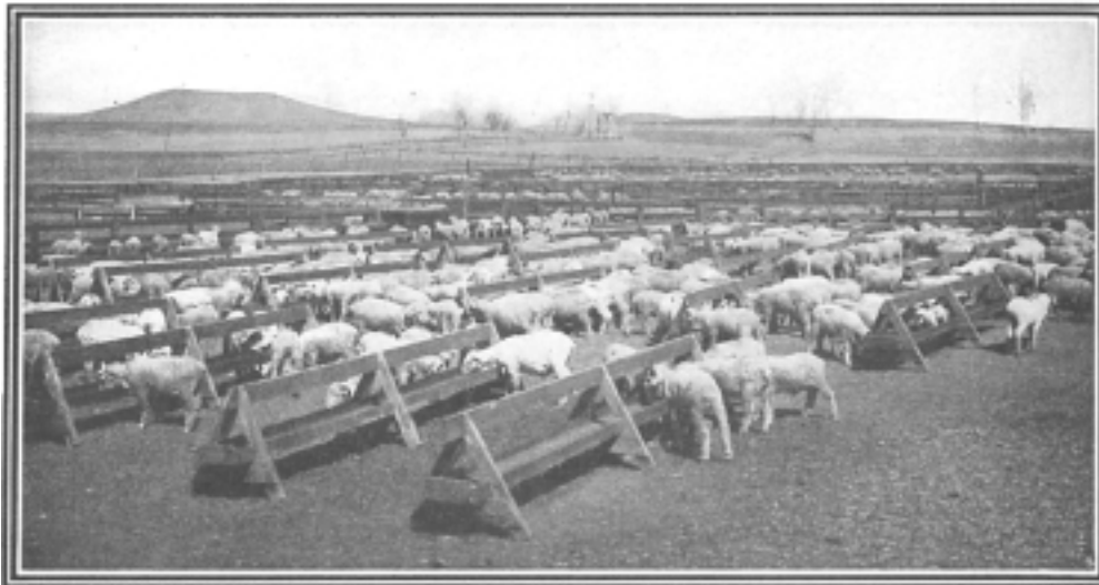
IMPORTED RAMBOUILLET LAMBS BEING FED ON A WESTERN SHEEP RANCH. They fail to live up to their pedigrees when compelled to "rustle" on the range.

ness of the air and the severity of the winters decrease the amount of "yolk" in the wool. The natural oils, which go to the fleece in a mild climate, especially where humid conditions prevail, are given to the body to increase the animal warmth. This decreases the weight of the fleece, and does much to account for the startling variations of the wool clip