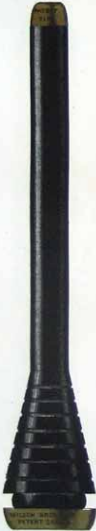
WILSON BROS. PATENT 25714