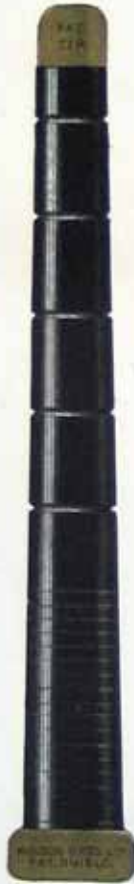
WILSON BROS. PATENT 25714