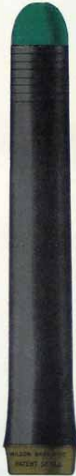
WILSON BROS. PATENT 25714