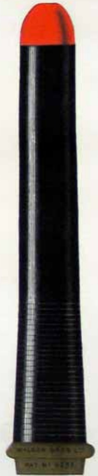
WILSON BROS. PATENT 25714