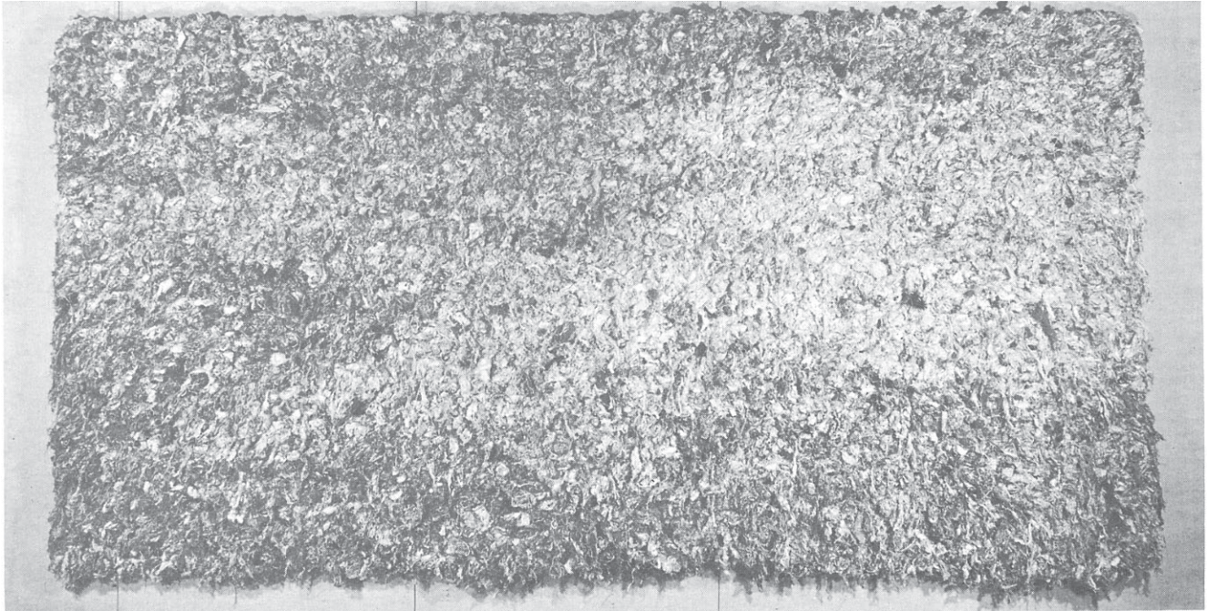
Up from Owens Valley I, 1974

can take it places, you know that you're making it yourself and you can make it again if you have to. It conforms itself to you, which is nice.