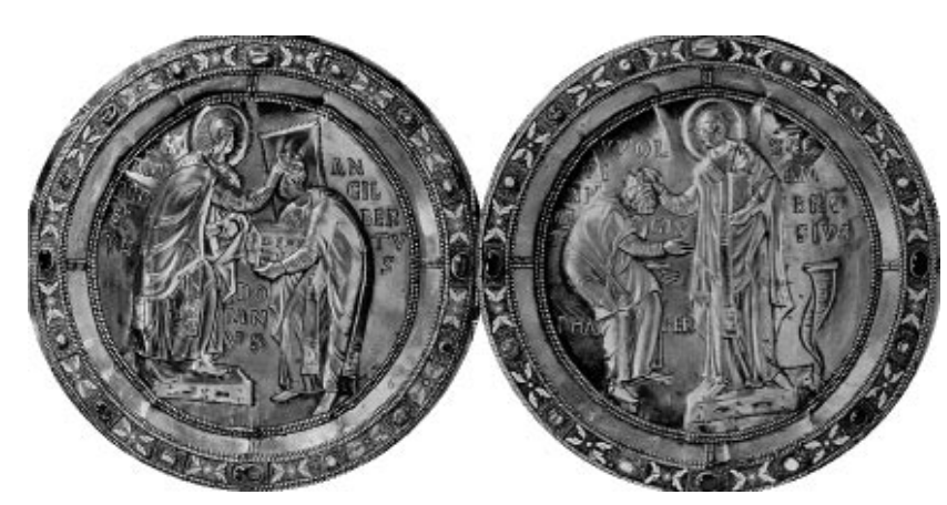
Paliotto of St. Ambrose, front & back

of the entire Catholic Church and thus God. Ecclesius' successors do not need to wear both the stole and pallium as the occasions for which they are memorialized do not call for such strong support of