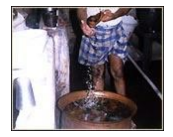
Stage 7 - Washing process in 5 various baths