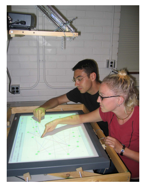
Fig. 1. Physical setup.

DiamondTouch table: The DiamondTouch hardware used in this study has a surface with a 79cm diagonal and a 4:3 aspect ratio. The table is connected through a USB cable to a Dell Pentium 4 desktop PC running Windows XP. All images, which normally appear on the display monitor, are routed to a video projector that