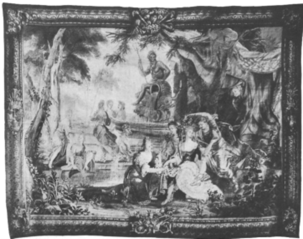
FLORA, THE GODDESS OF SPRING