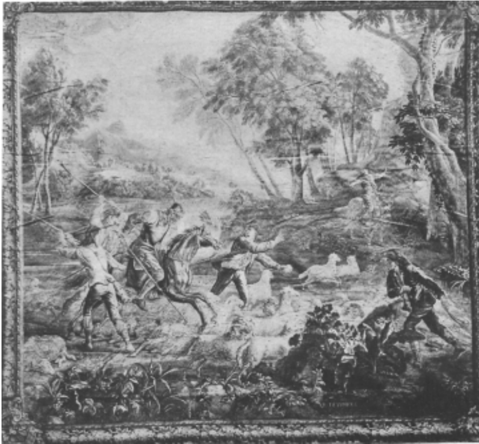
DON QUIXOTE KILLING SHEEP