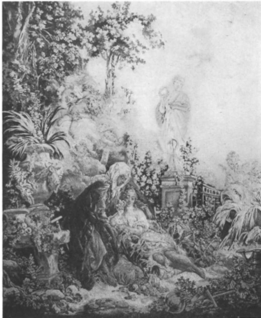
VERTUMNUS AND POMONA