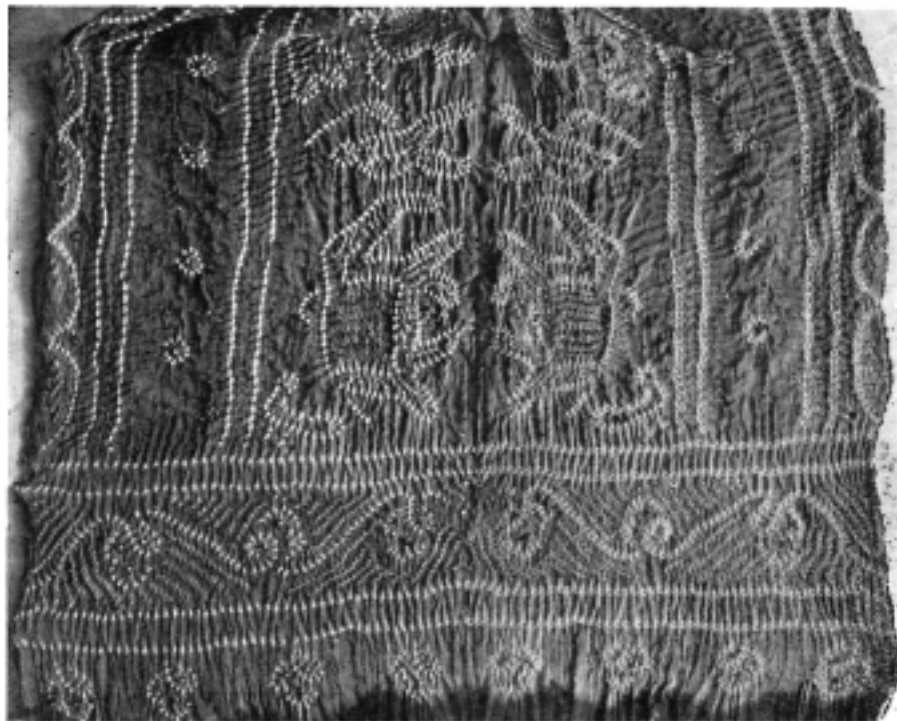
FIG. ONE: A PIECE OF ORIENTAL DYED WORK JUST AS IT CAME FROM THE BATH, WITH THE KNOTS STILL UNTIED. THE SAME PIECE OF DYED WORK WITH THE KNOTS UNTIED AND THE CLOTH SHAKEN OUT SO THAT THE DESIGN SHOWS.