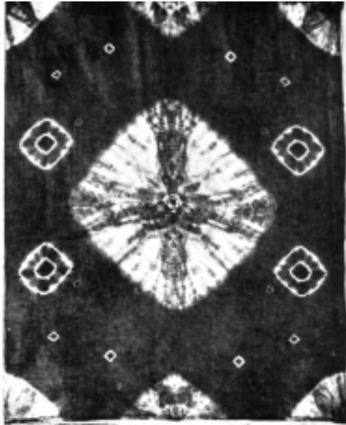
FIG. TWO: DYED WORK IN WHICH THERE ARE ONLY TWO COLORS, THE LIGHT PATTERN ON THE DARK GROUND.