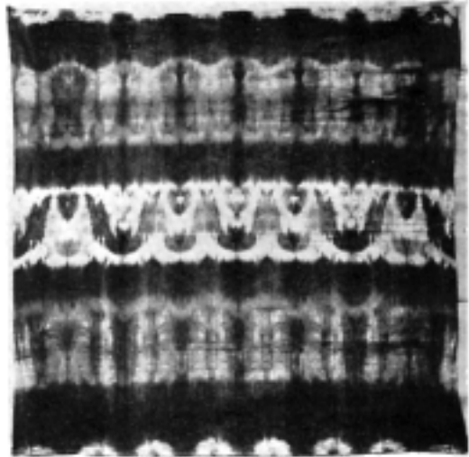
FIG. THREE: BANDED EFFECT IN DYED WORK, PRODUCED BY LOOPING THE CLOTH.