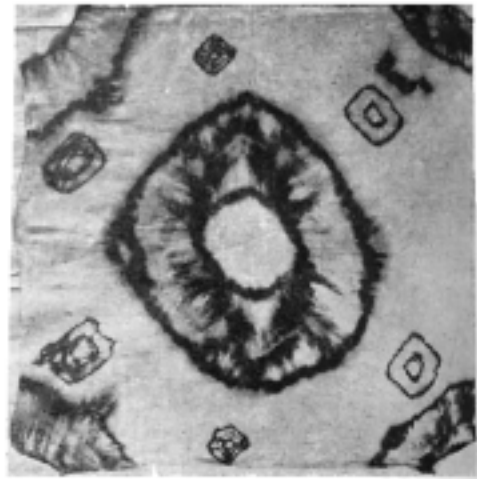
FIG. FOUR: DYED AND DISCHARGED WORK: BLUE AND GRAY PATTERN ON A WHITE GROUND.