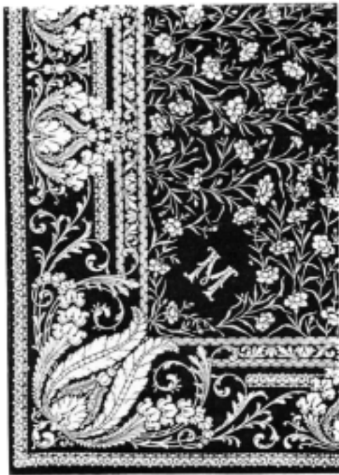
THE INITIAL TABLE DAMASK.

A CURIOUS souvenir of the Diamond Jubilee, which also serves as an example of the technical development of flax-weaving, was