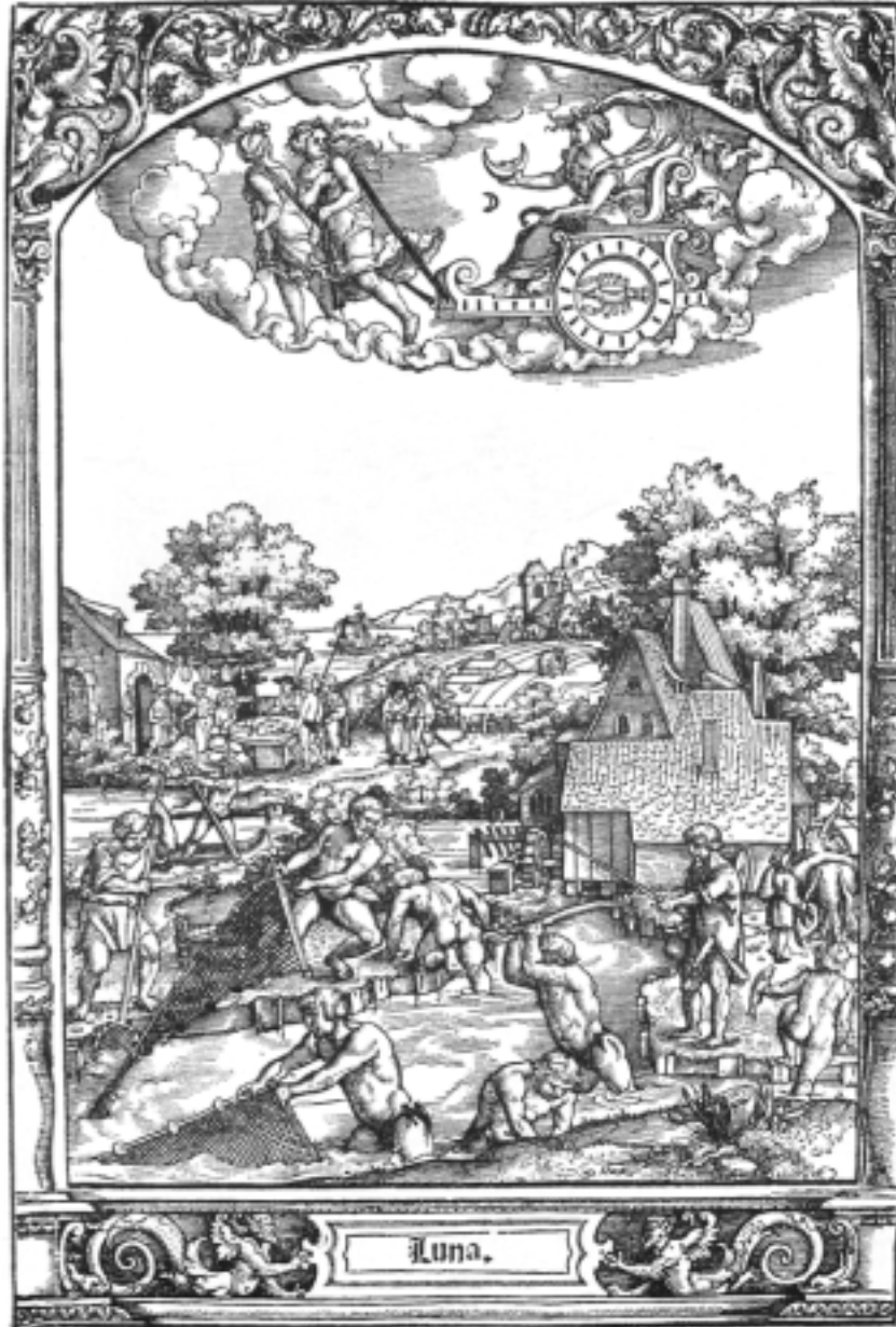
Plate II The Moon and her Children. Woodcut by Bartel Beham, 1531. From a Facsimile.