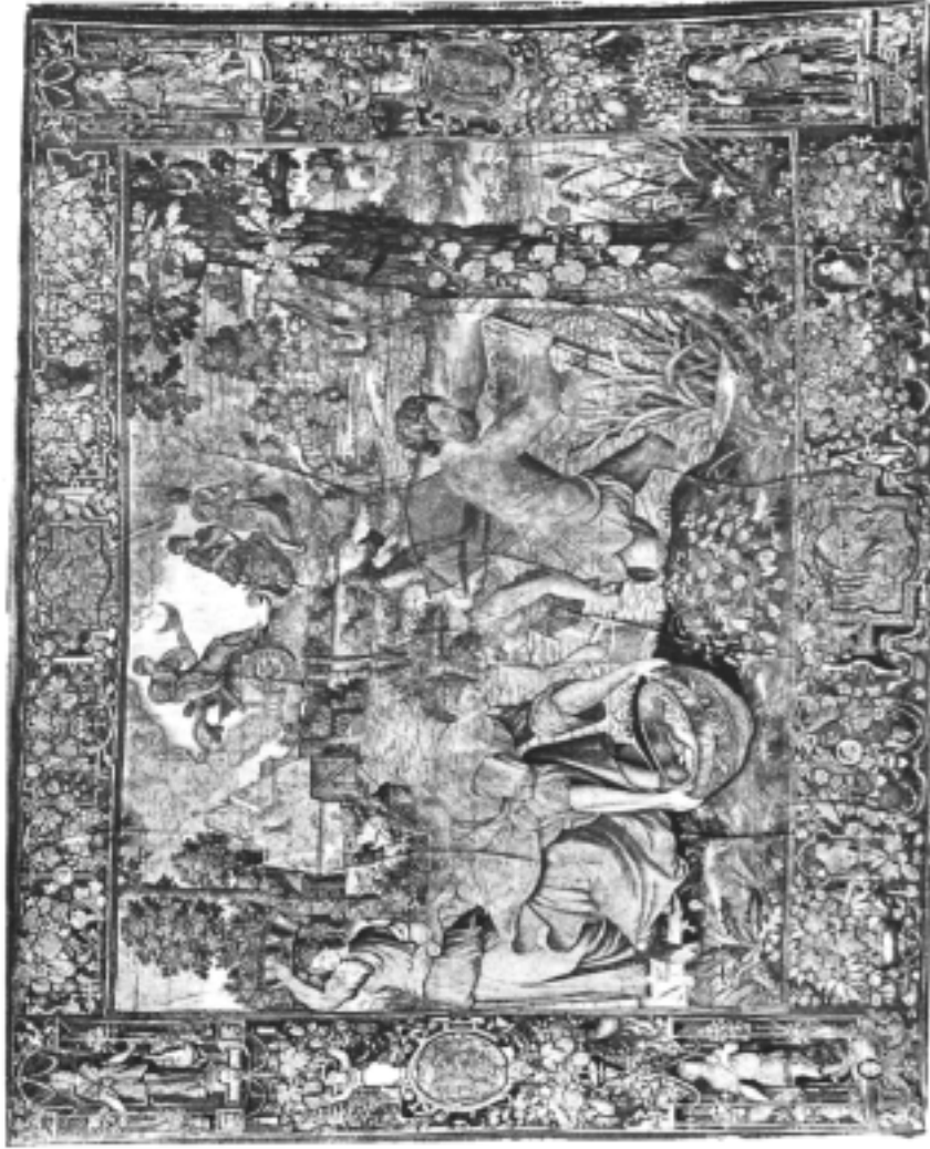
Plate III The Moon and her Children. Tapestry, Flemish, mid XVI century. Bayerisches Nationalmuseum Munich.