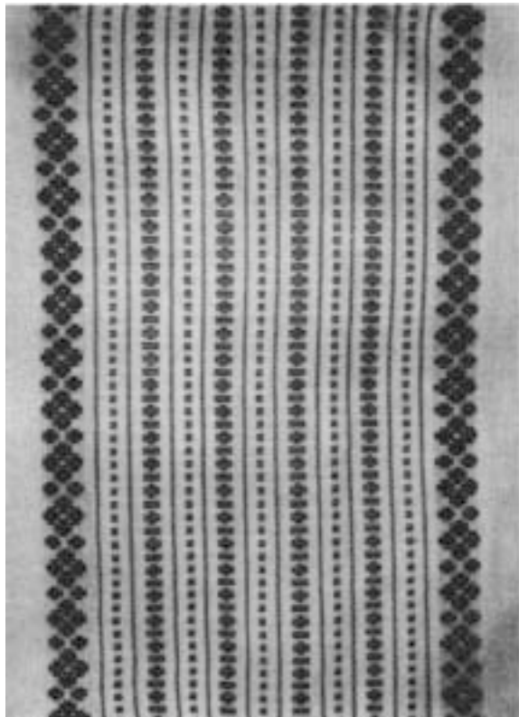
Luncheon Set—Red and Blue.

I thought it would be a simple matter to equip a four harness loom with a framework to hold up dowel rods—a method described by Nellie Sargent in "The Weaver". I also thought all I had to do was to thread the loom in a simple pattern so that if anything happened to our experiment I could use the warp myself. A threading for plain weaving is all that is necessary for their type of weaving. But those ideas were all wrong. My weaver insisted that the loom must have only two treadles, two harnesses and string heddles (not wire ones) with eyes an inch long. I