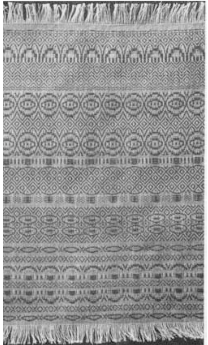
Illustration B Blend of Honeysuckle and Goose-Eye

ton, Ill. enclosing a self addressed stamped envelope. For questions other than to explain an apparent vagueness or a definite incompleteness in the article there will be a suitable charge.