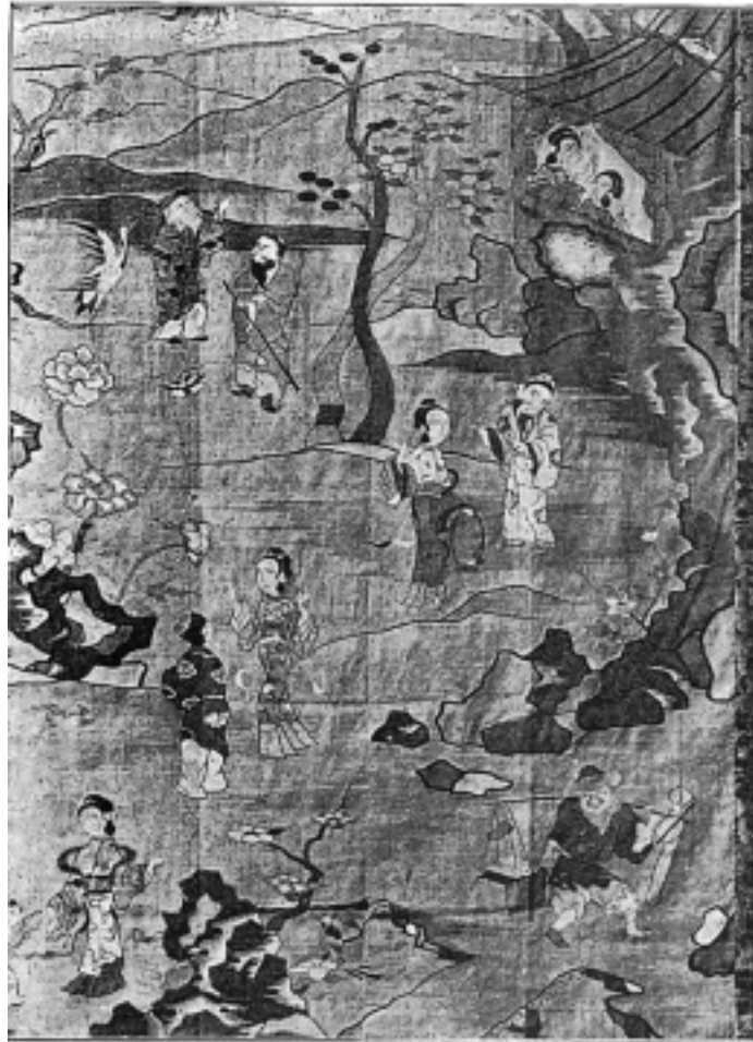
Fig. 5.—PART OF A SILK TAPESTRY-WEAVING.

remarkable specimen extant of this shape for wall-hangings. But a very early if not the earliest known wall-hanging of tapestry-weaving is Byzantine in style of pattern, and dates from the twelfth or thirteenth century. A large fragment of it is in the Museum at Lyons, and a little bit of its border only in the South Kensington Museum. The ornament consists of a series of repeated roundels, in each of which is a species of dragon or bird pinning some emblematical quadruped. A cen-