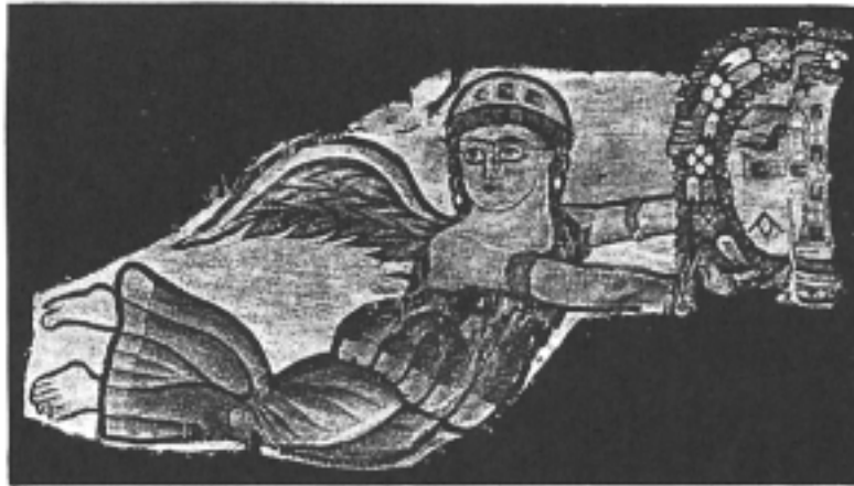
Fig. 3.—TAPESTRY-WOVEN WINGED FIGURE INSERTED INTO A LINEN CLOTH.

( Egypto-Roman. Fourth to Sixth Century A.D. About one-fourth the actual size. )