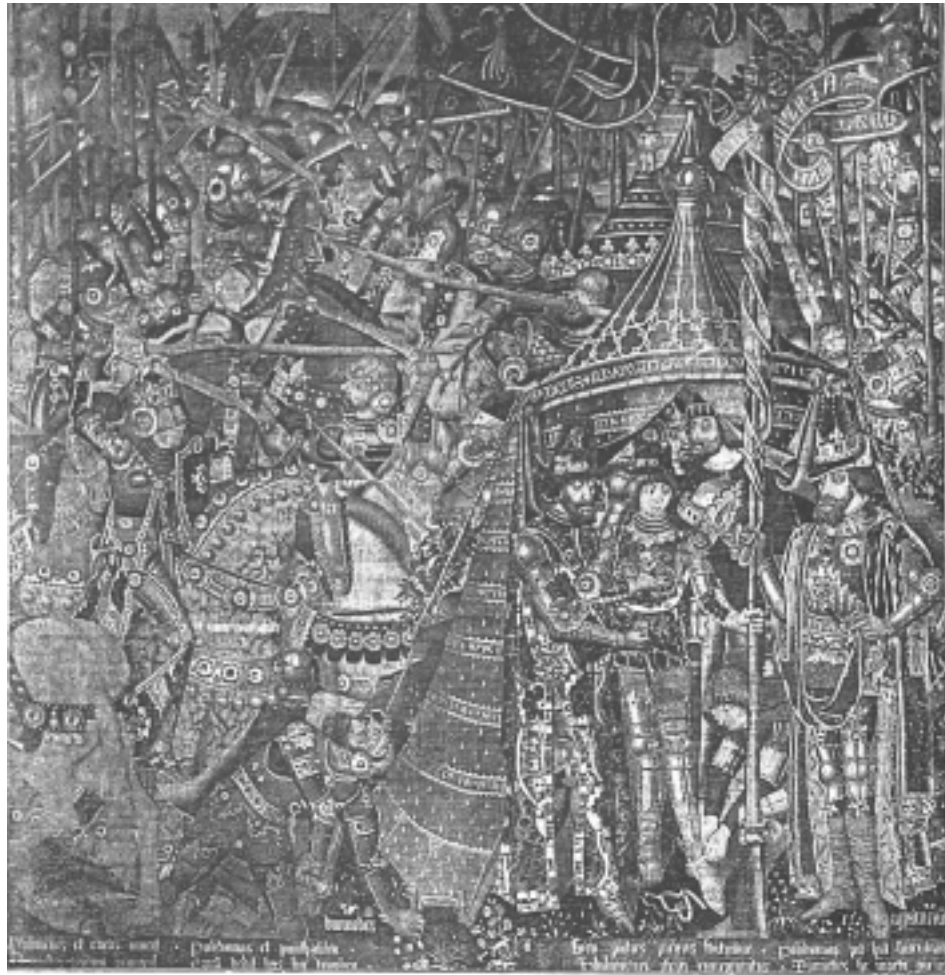
Fig. 4.—PART OF A WALL-HANGING OF SILK AND WORSTED TAPESTRY-WEAVING ON STRING WARPS.

An intermingling of Roman and Persian influences is traced in certain ornamented works of the Sassanian epoch (third to seventh century A.D.), and blossomed in Egypt during the conquest of that country by Chosroes II. (seventh century A.D.). The horseman of Fig. 2 has a Perso-Roman appearance, whilst the rectangular border about him composed of ducks and fish, a pomegranate