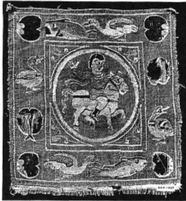
Fig. 2.—TAPESTRY-WOVEN SQUARE.

was taken, with many other Greek works of art, from a tomb, identified as the Tomb of the Seven Brothers, near Tenriouk, in the province of Kouban (once a Greek colony), on the eastern shores of the Sea of Azoff. A full account, with illustrations of these relics, is given in the Compte Rendu of the Imperial Archaeological Commission (1878-1879). There is little room for doubting that they are, according to Stephani, of the third and fourth centuries B.C. Apart from the style of the ornament, the drawing of the ducks, their colouring, and so forth, the bare fact that they are witnesses to the use at this early date of the tapestry-weaving process