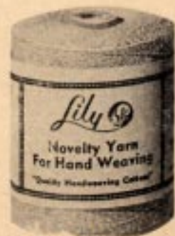
ART. 105 LILY NOVELTY YARN

All towels were woven 28" long including hems.