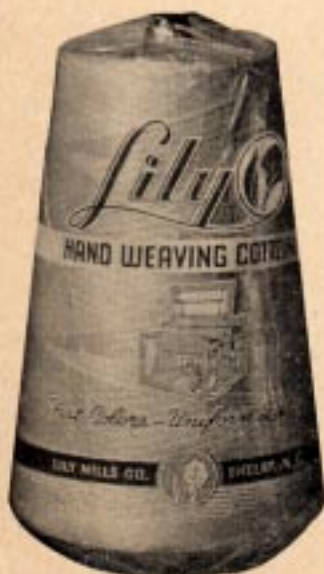
ART. 714 LILY SOFT TWIST

TIE UP X X X O O O O X O X X O O O X O X X X O O X O X 6 5 4 3 2 1 X FALLING SHED O RISING SHED