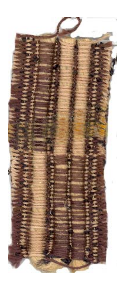
Sample from page 4