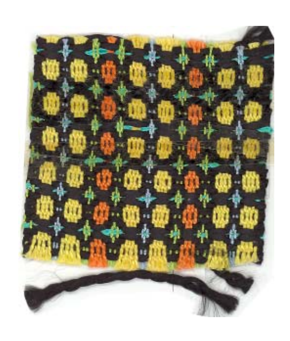
Sample page 4