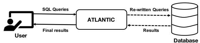
Figure 1: A Middleware Between the User and Database

This work is licensed under the Creative Commons BY-NC-ND 4.0 International License. Visit https://creativecommons.org/licenses/by-nc-nd/4.0/ to view a copy of this license. For any use beyond those covered by this license, obtain permission by emailing info@vldb.org . Copyright is held by the owner/author(s). Publication rights licensed to the VLDB Endowment. Proceedings of the VLDB Endowment, Vol. 14, No. 12 ISSN 2150-8097. doi:10.14778/3476311.3476337